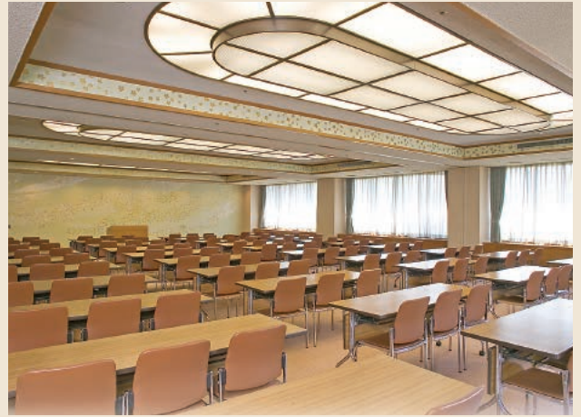
401 and 402 Meeting rooms (Large meeting room)