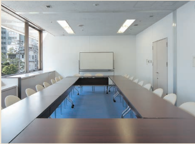
Meeting room 204