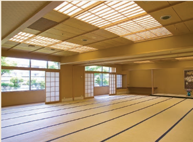
Meeting room 408, 409, 410 (Japanese-style rooms can be joined to form one large room.)