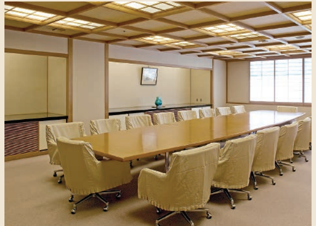
Meeting room 407